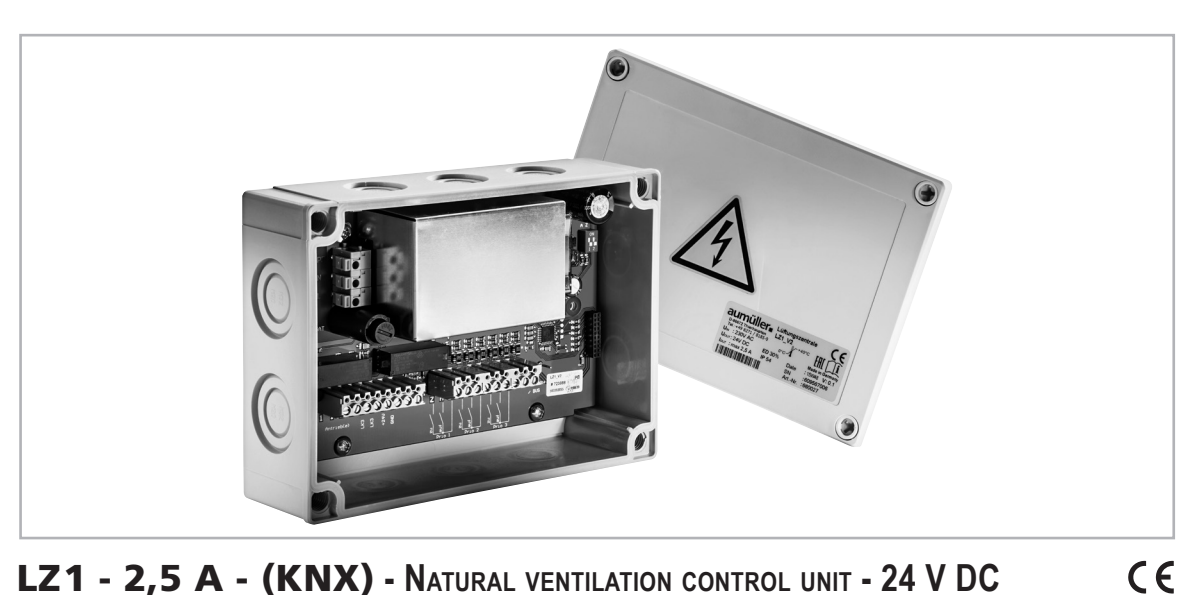
LZ1 - 2,5 A - (KNX) - NATURAL VENTILATION CONTROL UNIT - 24 V DC